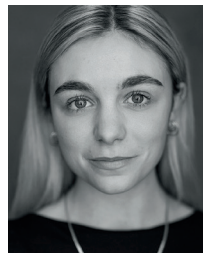
Maria · Officer · Priest (Fight Captain)