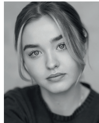
Sir Toby Belch