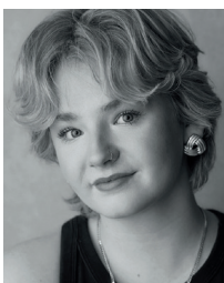
Feste (Chorus Captain)