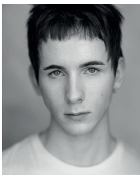
Sir Andrew Aguecheek (Dance Captain)